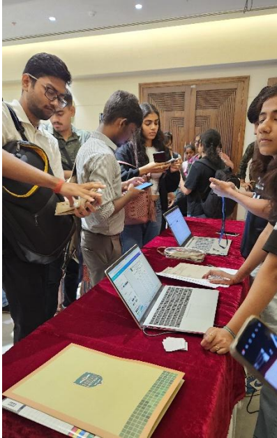
(Registration of the Participants)