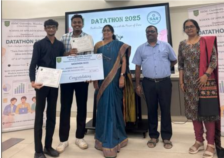
(2 nd Runner Up of DATATHON 2025)