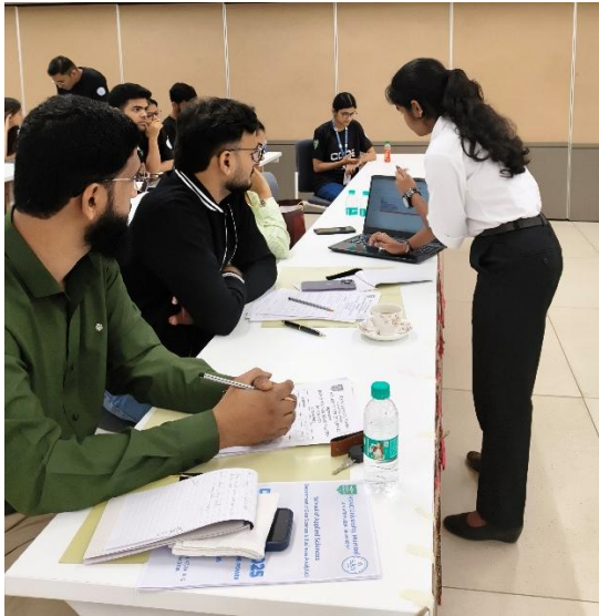
(Participants presenting their analysis)