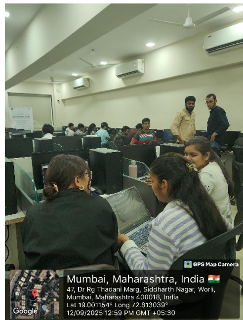
(Participants begin their analysis on the data)