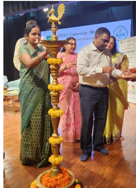
(Lamp Lightening Ceremony)