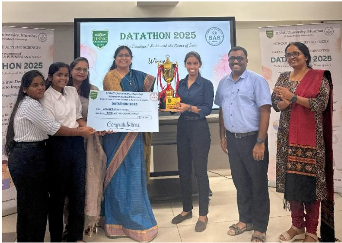
(Winner of DATATHON 2025)