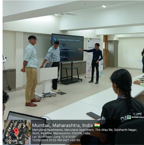
(Participants presentations round)