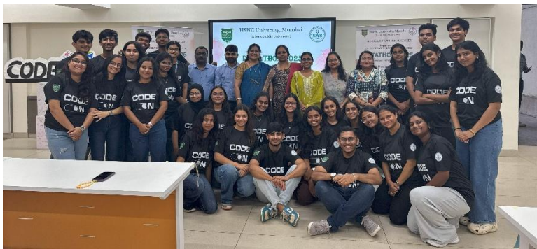
(Datathon Team 2025)